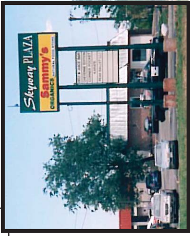
Sign Ground Lease